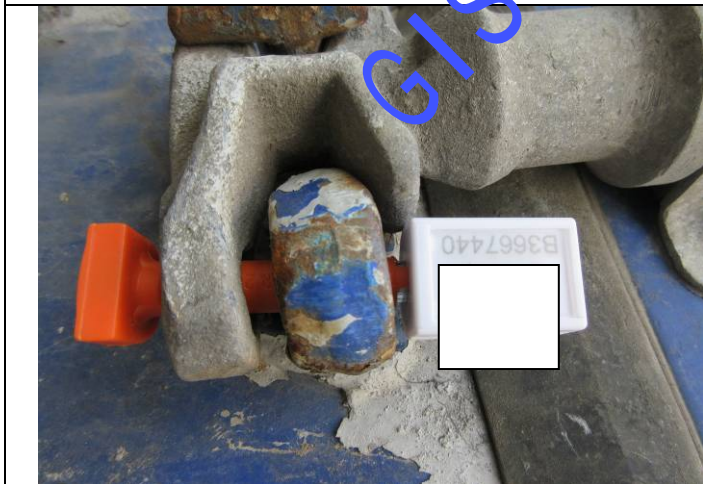
21_seal the container