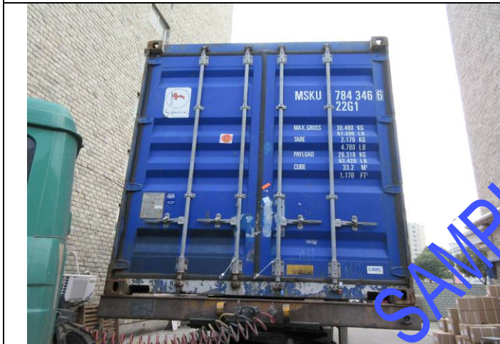
19_seal the container