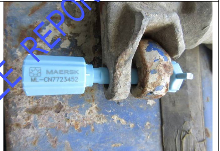
20_seal the container