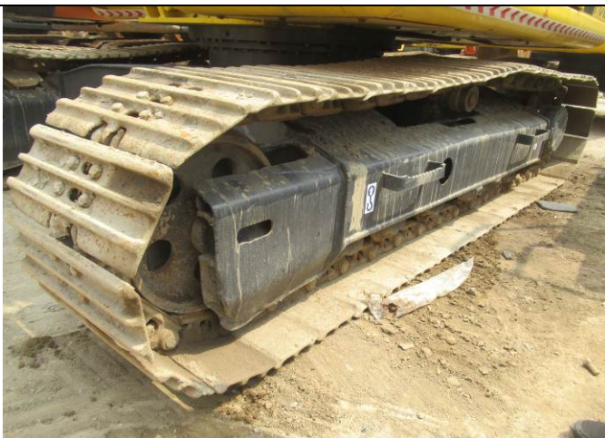
17 Excavator view