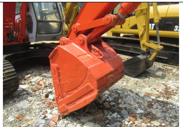
18 Excavator view