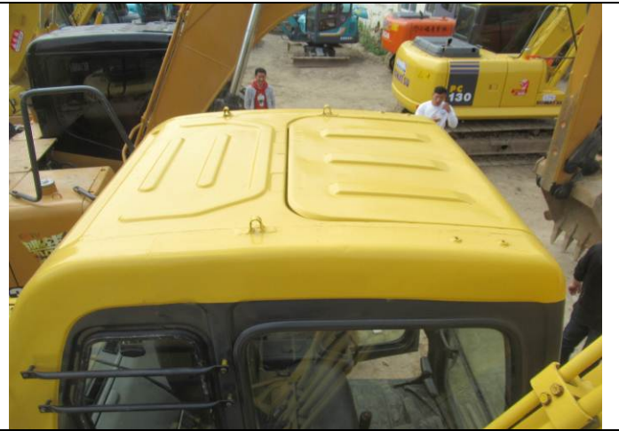
50 Excavator view