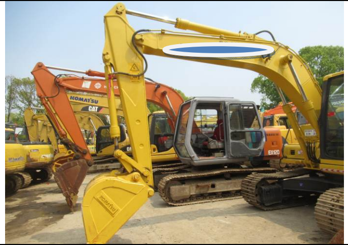
8 Excavator view