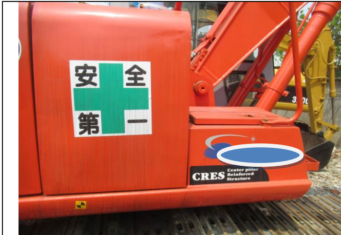
13 Excavator view