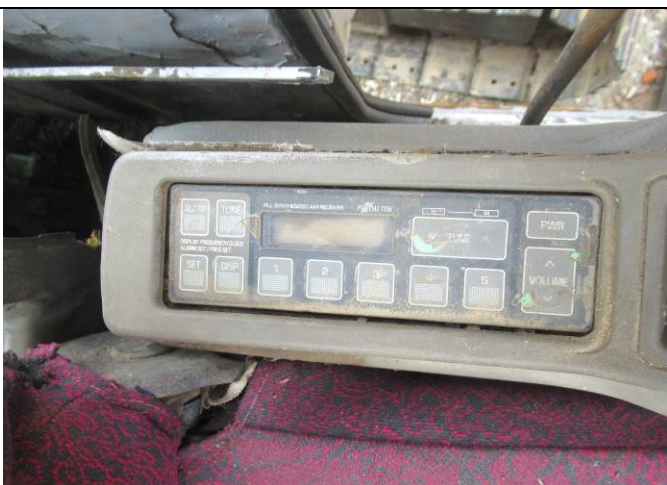
41 Excavator view