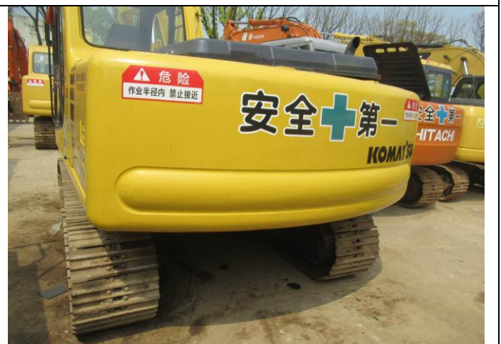
24 Excavator view