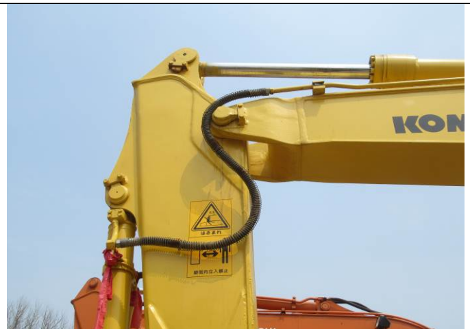
10 Excavator view