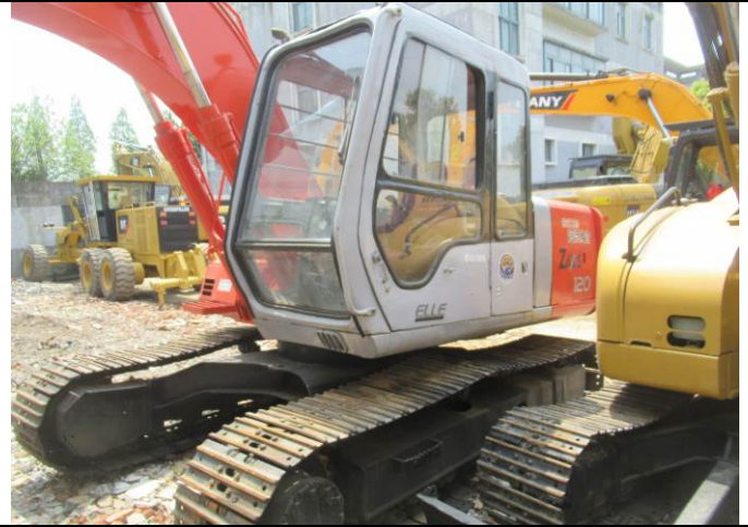
26 Excavator view