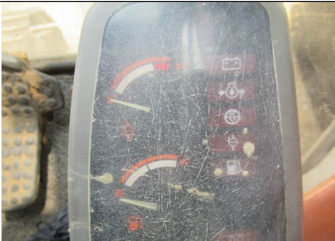
45 Excavator view