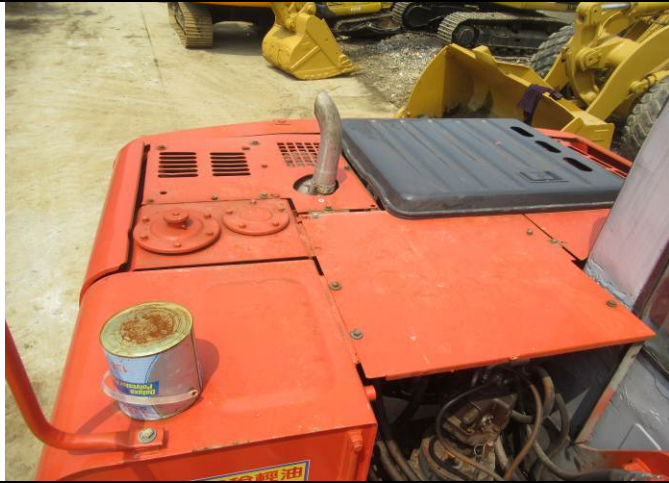
49 Excavator view