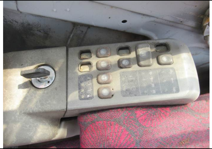
44 Excavator view