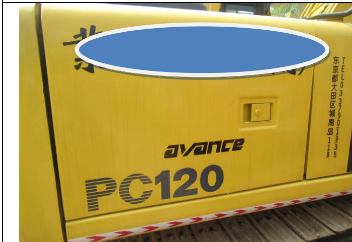
27 Excavator view