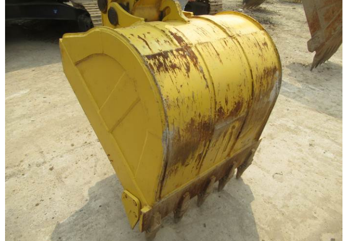
2 Excavator view