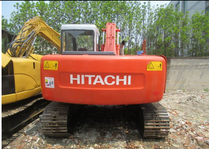
1 Excavator view