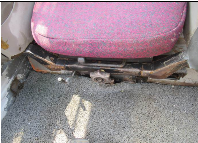
39 Excavator view