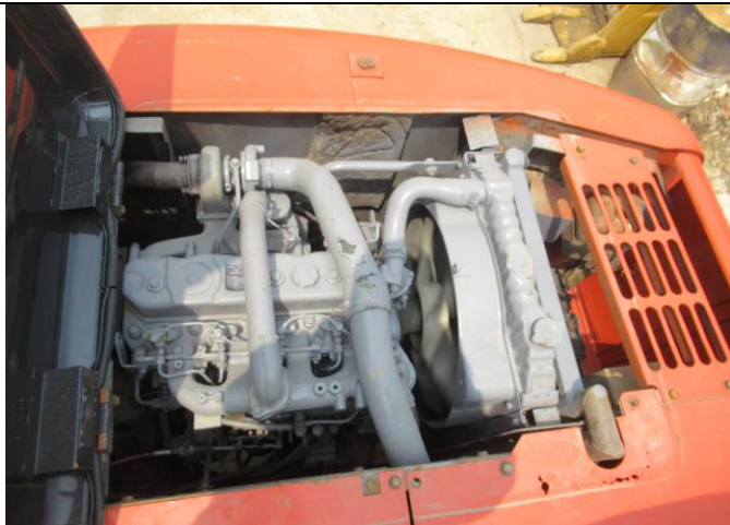
51 Excavator view