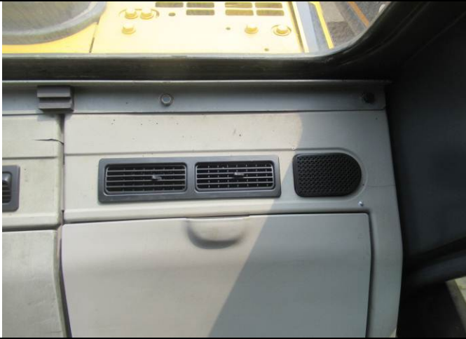
37 Excavator view