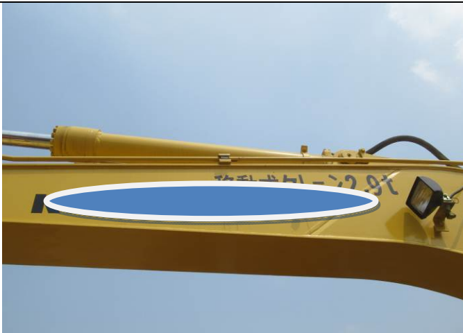
11 Excavator view