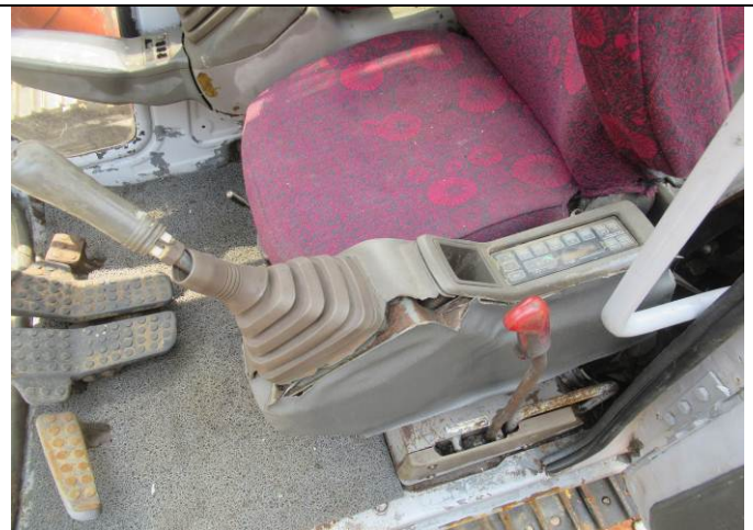
40 Excavator view