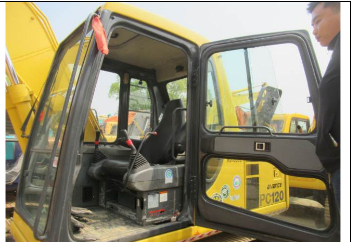
32 Excavator view