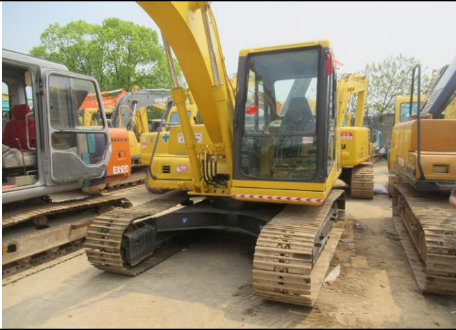
7 Excavator view