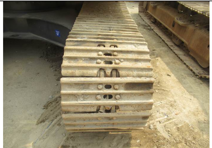
12 Excavator view