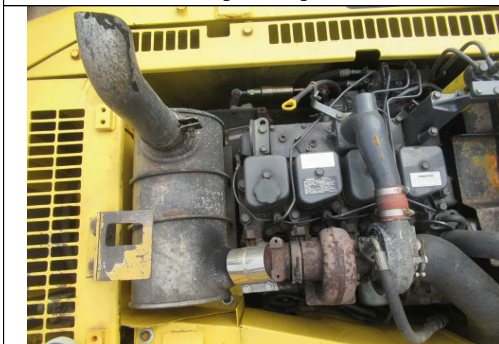
47 Excavator view