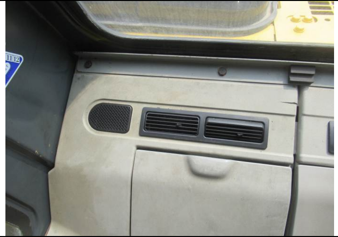
38 Excavator view