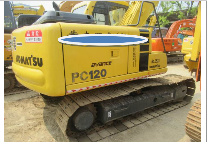
26 Excavator view