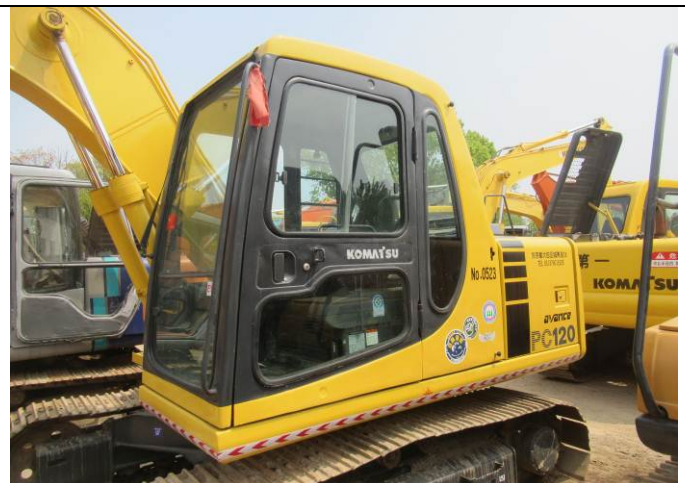
18 Excavator view