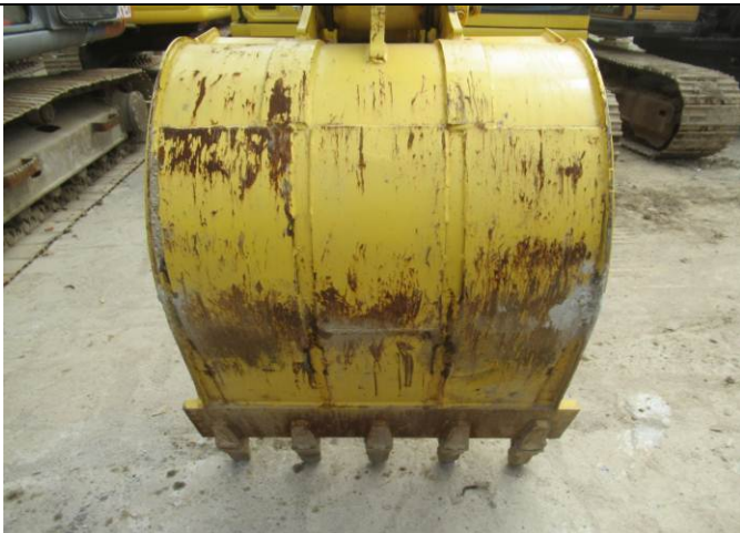
3 Excavator view