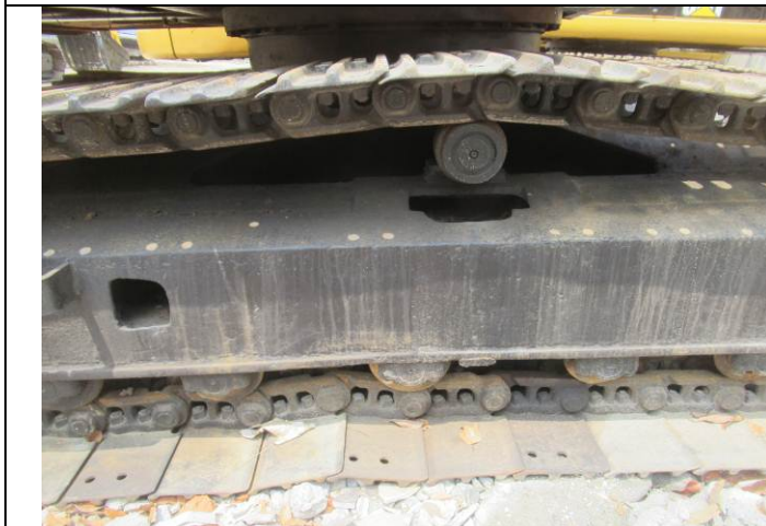
15 Excavator view