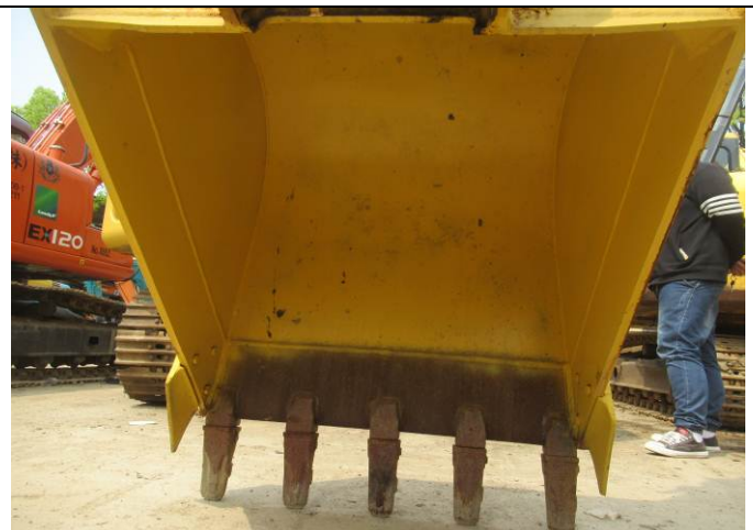
6 Excavator view