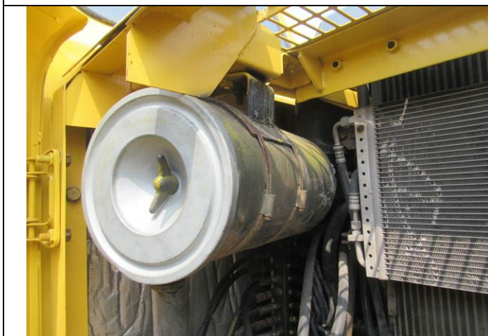
23 Excavator view