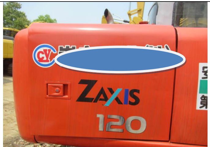
10 Excavator view