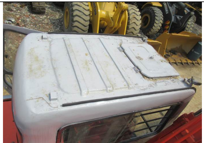
54 Excavator view