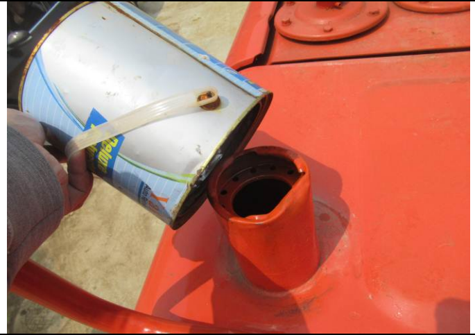
50 Excavator view