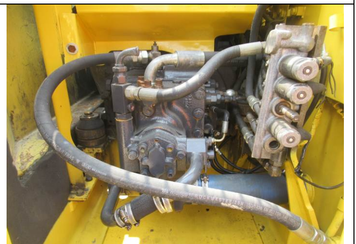
30 Excavator view