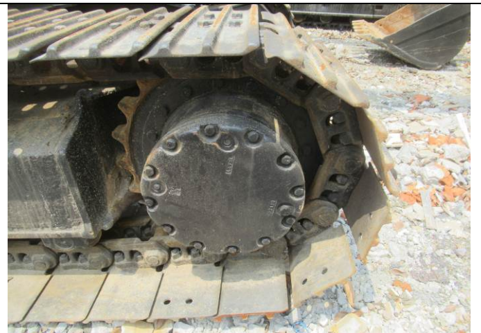
16 Excavator view