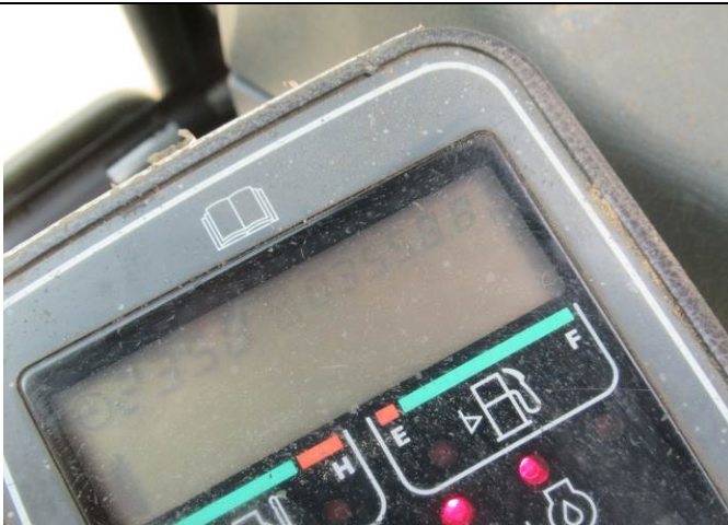
41 used hours