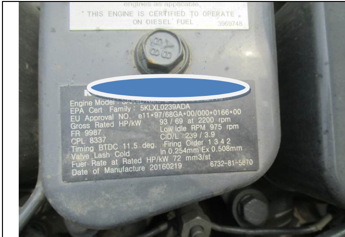
43 Engine rating label