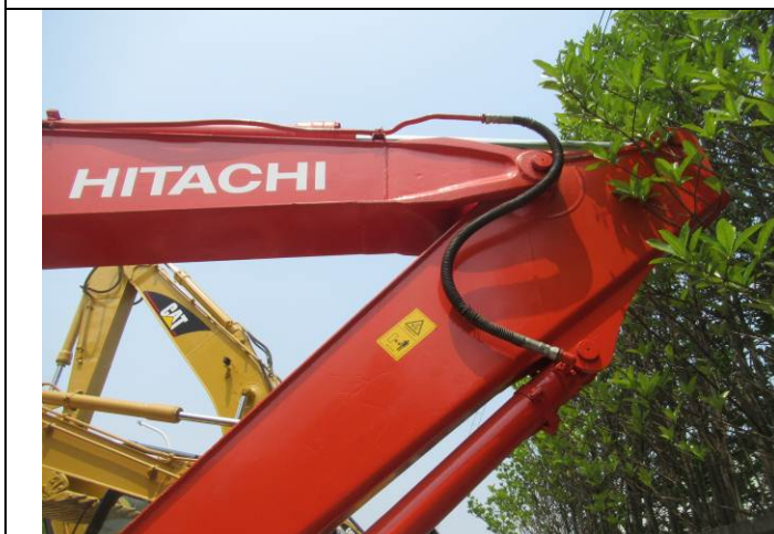
17 Excavator view