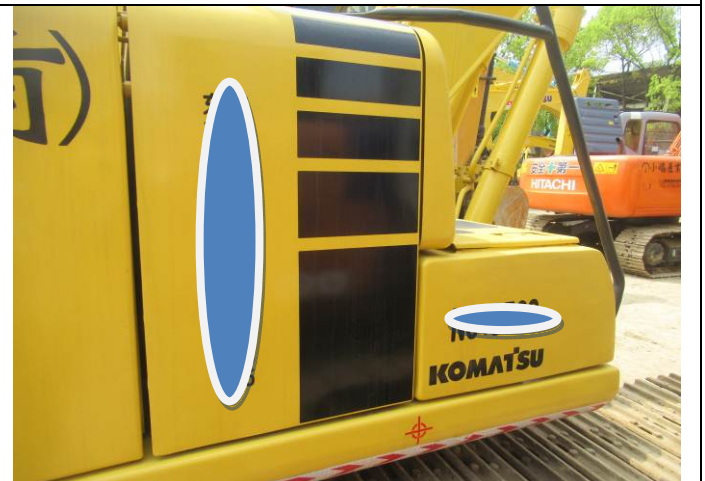
28 Excavator view