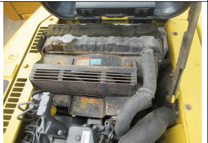
46 Excavator view