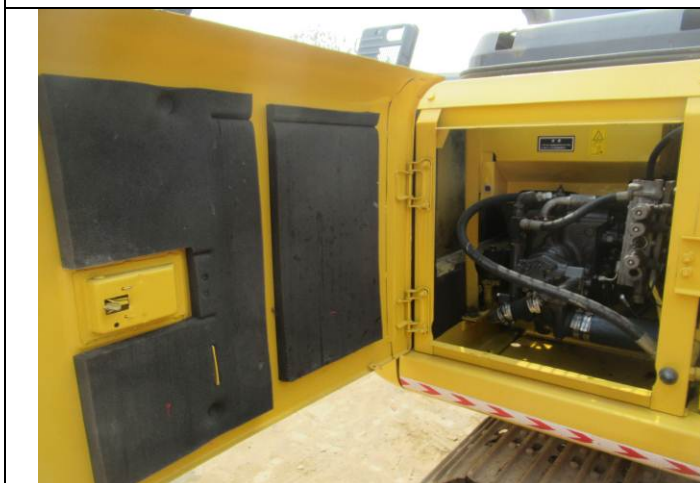
29 Excavator view