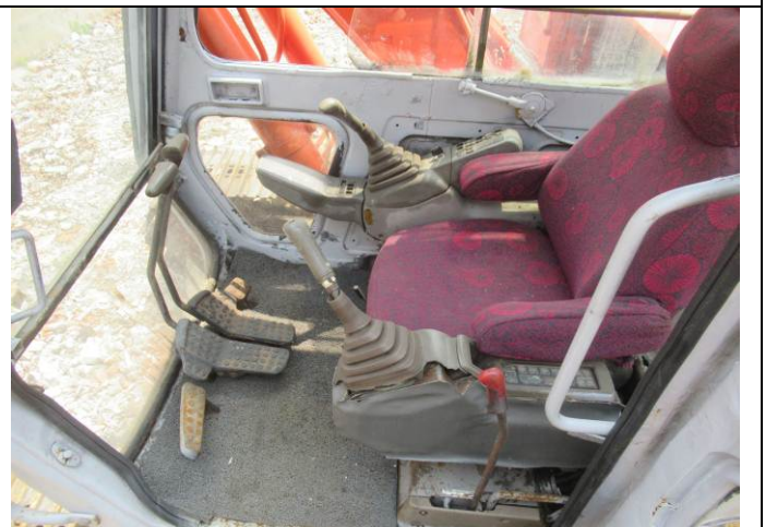
36 Excavator view