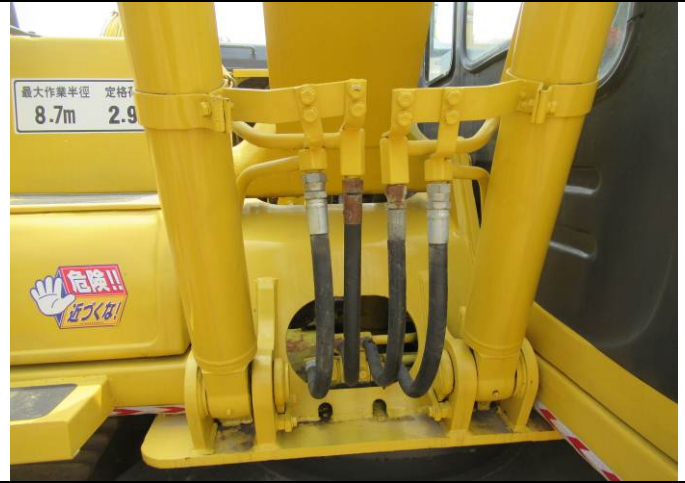
14 Excavator view