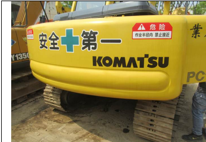
25 Excavator view