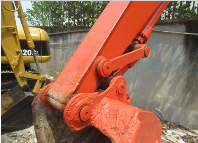
21 Excavator view