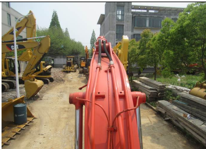
53 Excavator view