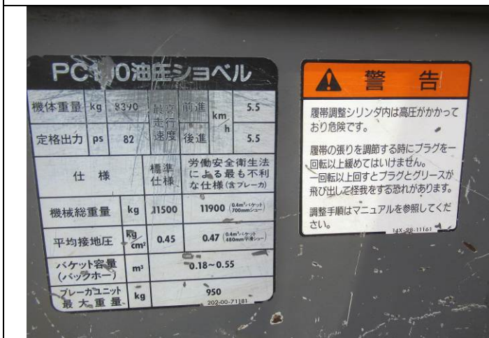
33 Excavator rating label