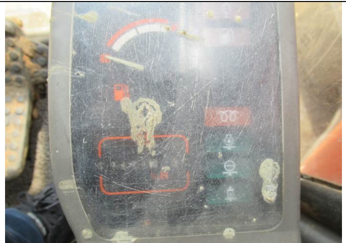
46 Excavator view