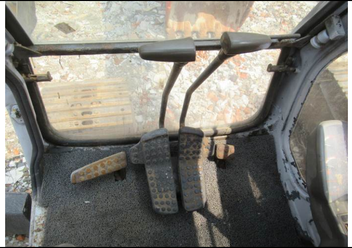
38 Excavator view