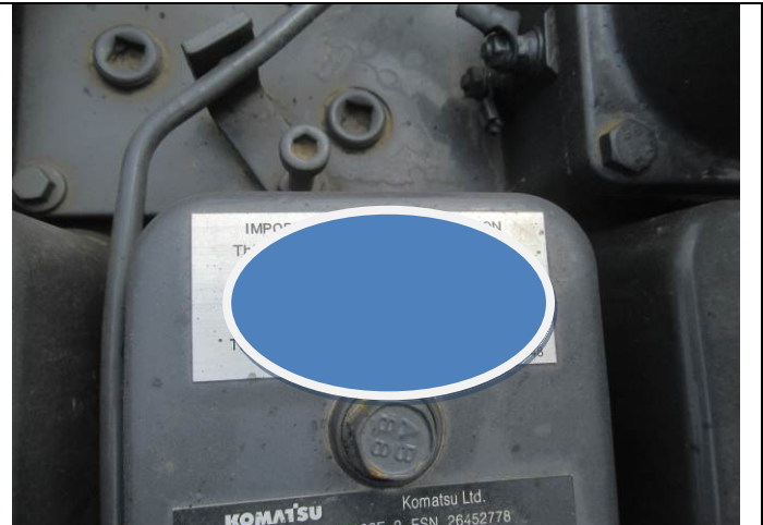
44 Excavator view