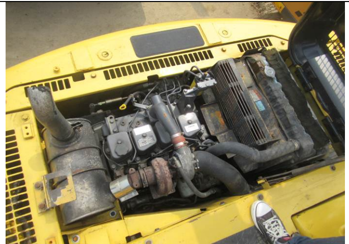
42 Excavator view