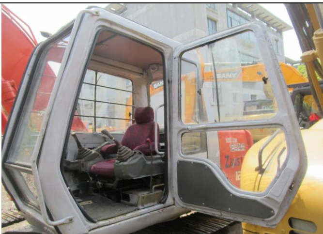
35 Excavator view