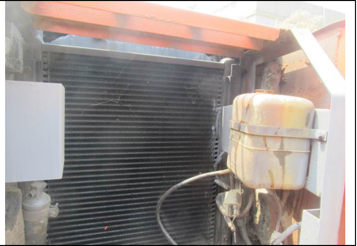
32 Excavator view