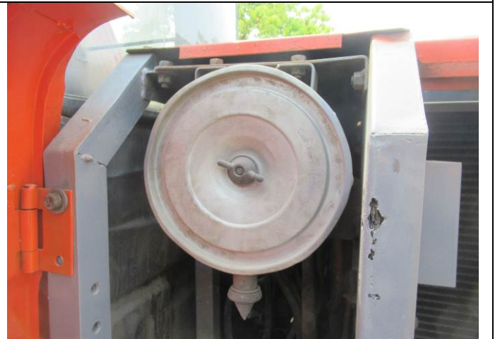
34 Excavator view