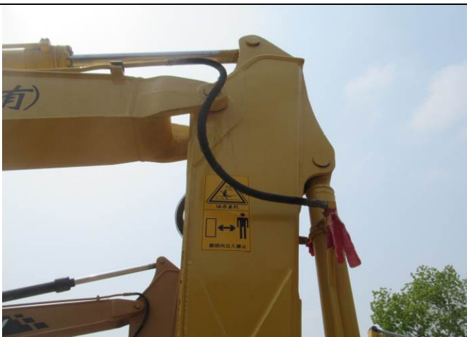
5 Excavator view