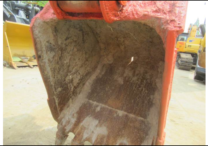
20 Excavator view