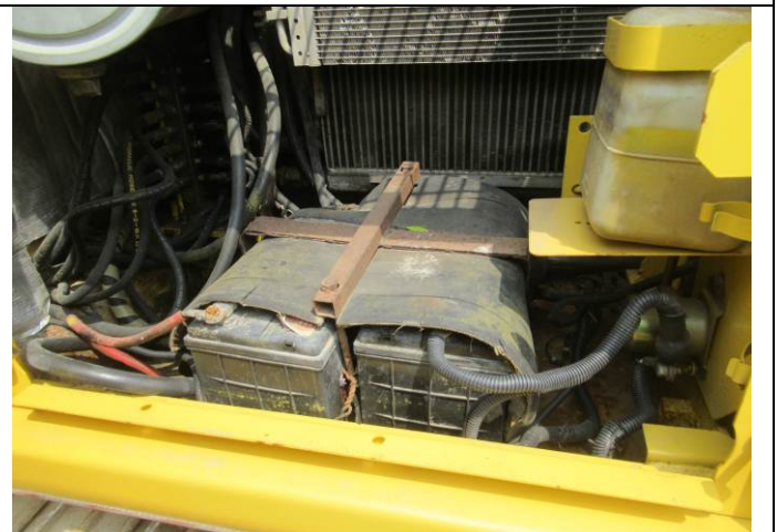
22 Excavator view