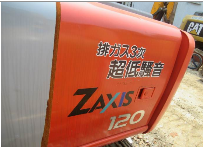
29 Excavator view