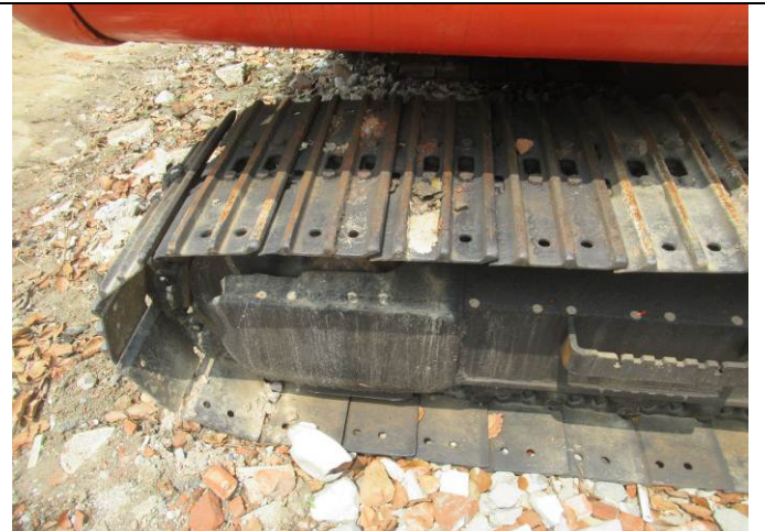
14 Excavator view