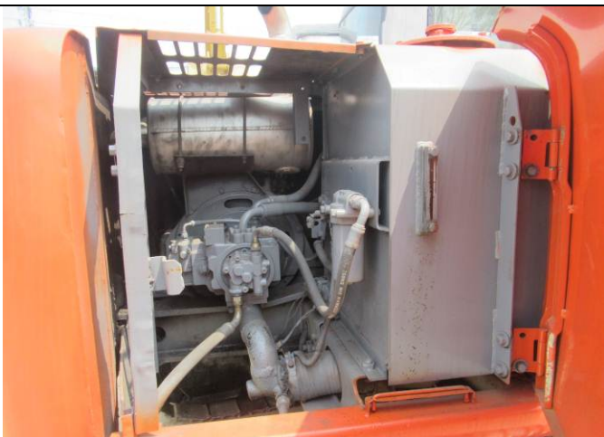
11 Excavator view