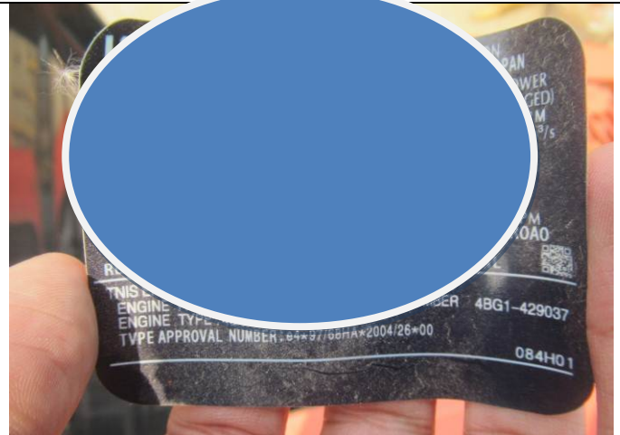
52 engine plate