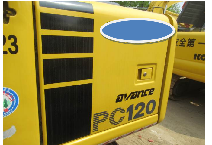
20 Excavator view