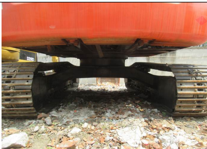
5 Excavator view