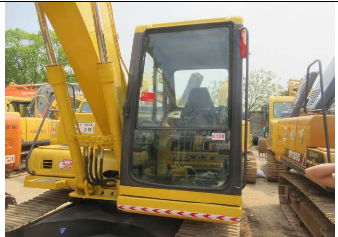
16 Excavator view