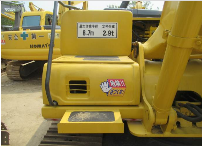
15 Excavator view