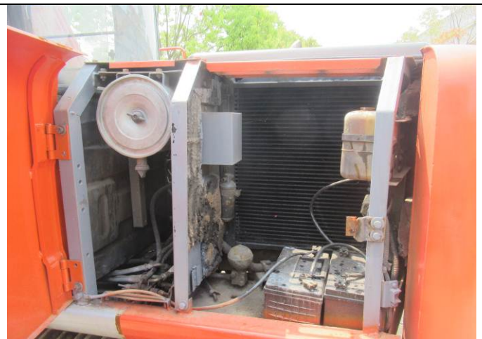
30 Excavator view