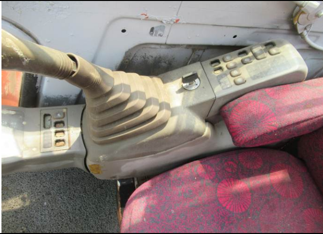
43 Excavator view