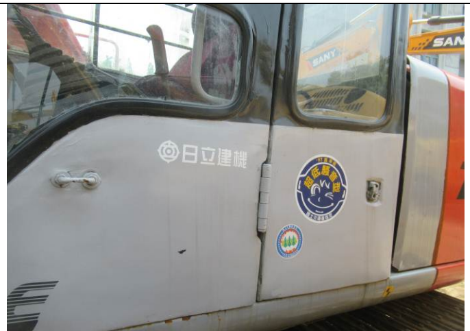
28 Excavator view