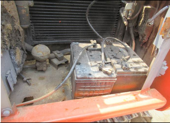
31 Excavator view