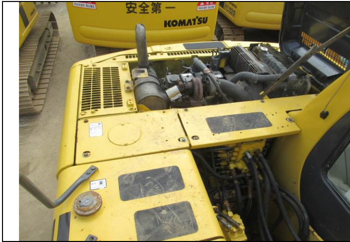
49 Excavator view