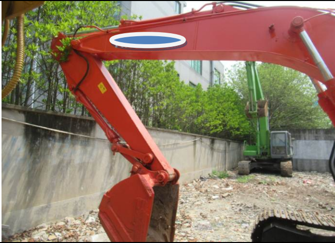
25 Excavator view