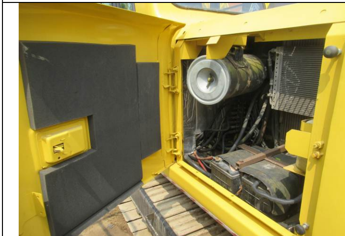
21 Excavator view