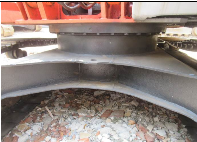
27 Excavator view