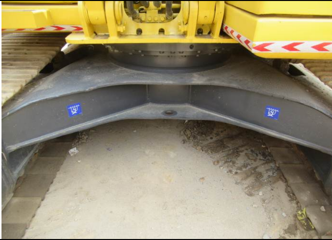
13 Excavator view