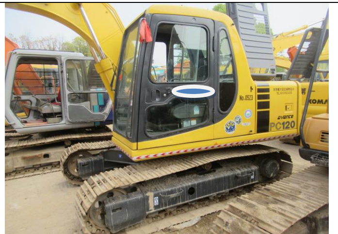
52 Excavator view