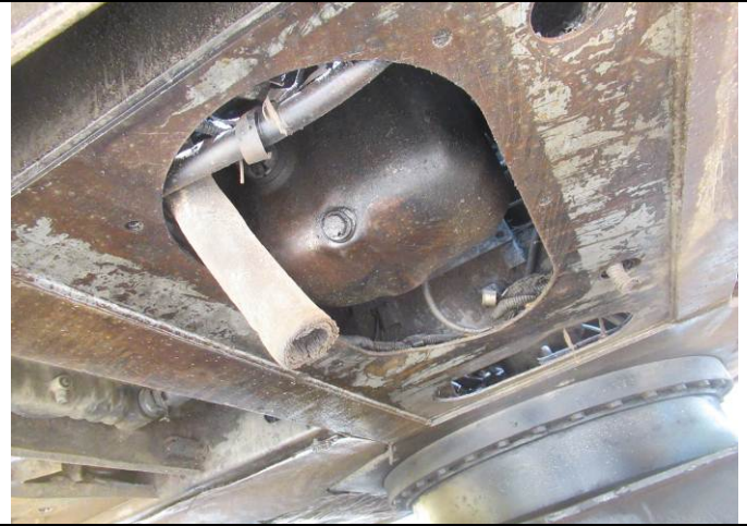
8 Excavator view