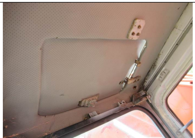
42 Excavator view