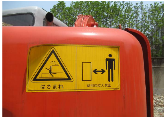
4 Excavator view