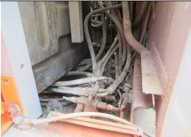
33 Excavator view