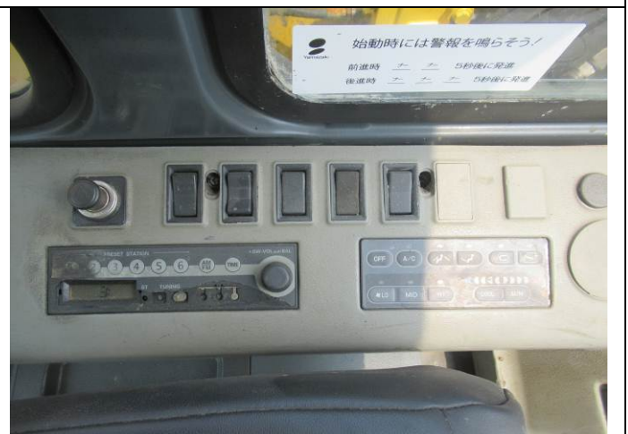
36 Excavator view