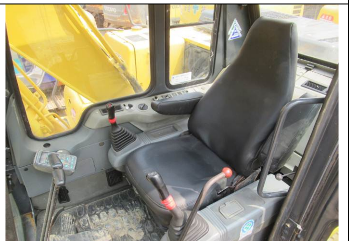
34 Excavator view