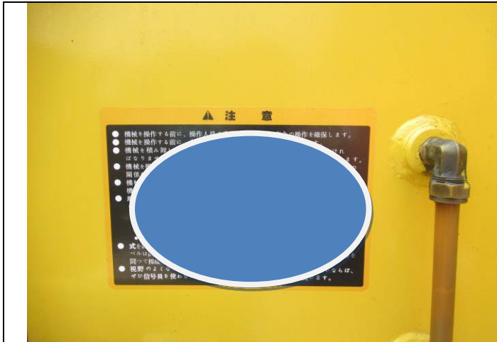
31 Excavator view