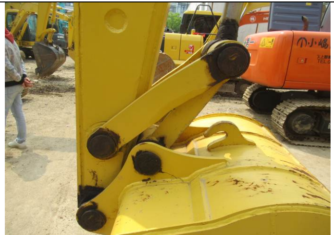
4 Excavator view