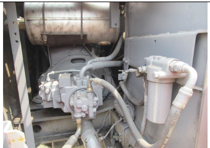
12 Excavator view