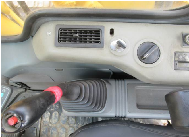
39 Excavator view