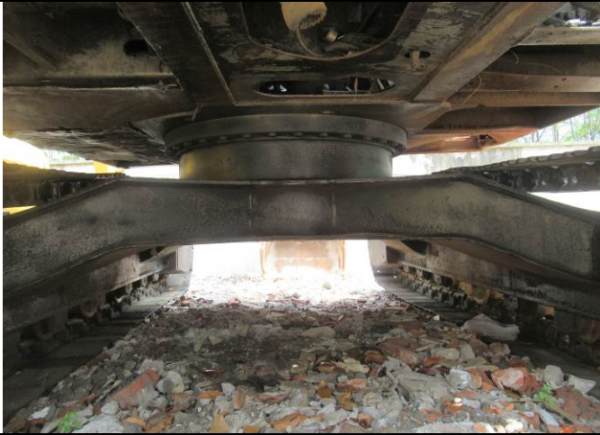
7 Excavator view