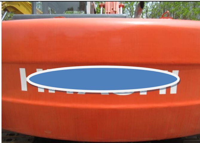
3 Excavator view