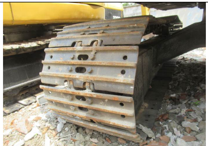
6 Excavator view