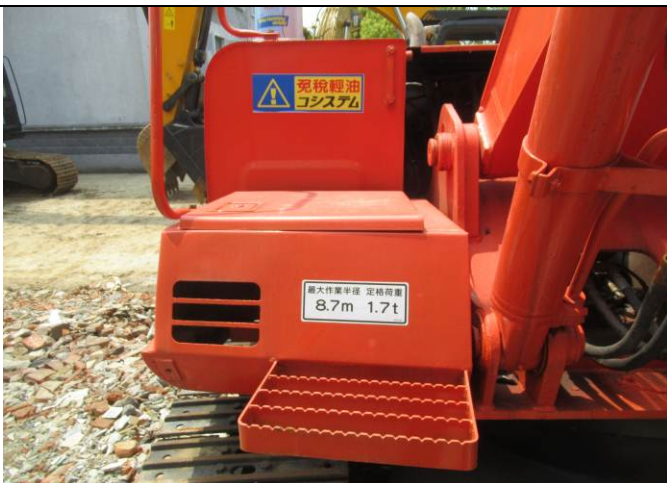
23 Excavator view