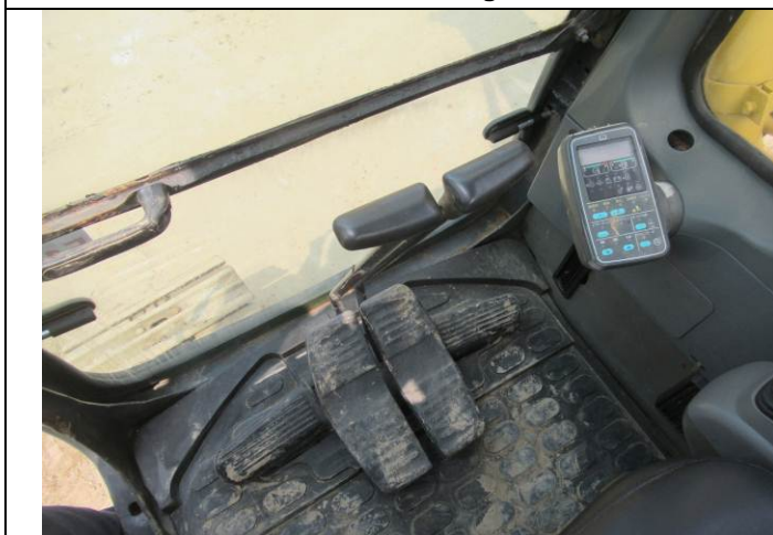
35 Excavator view