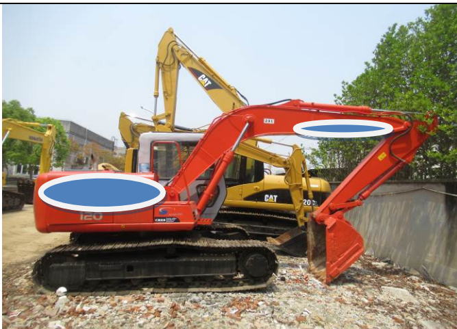
9 Excavator view