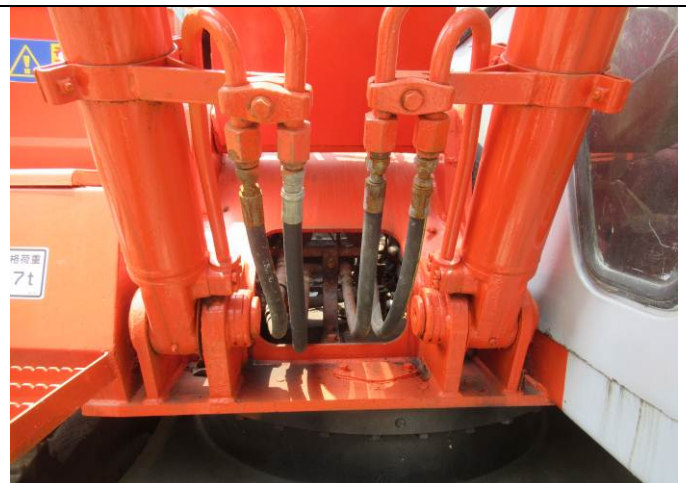
24 Excavator view