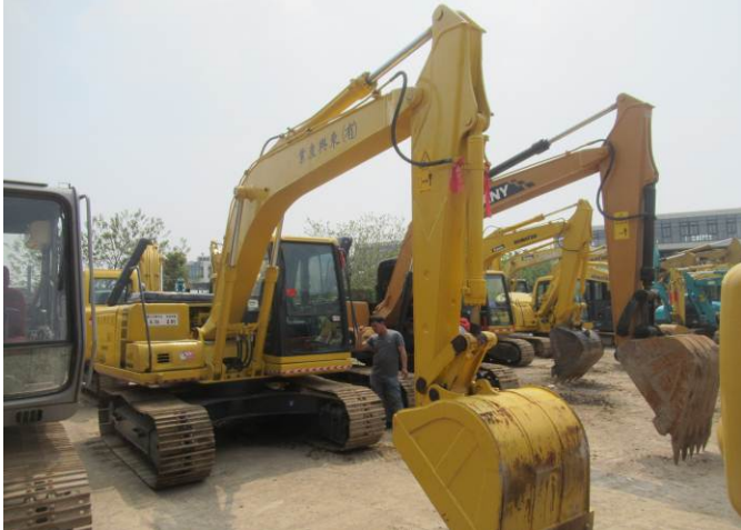
1 Excavator view