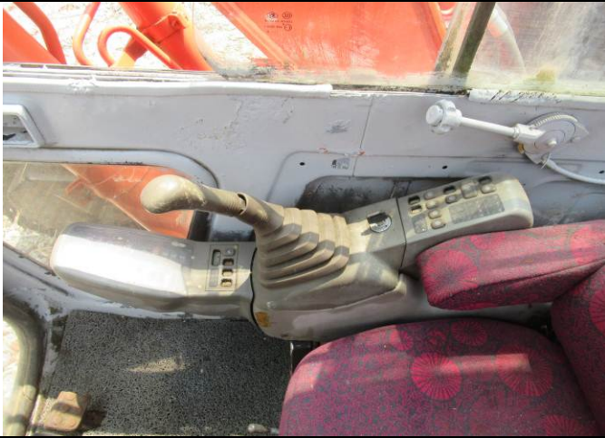
37 Excavator view