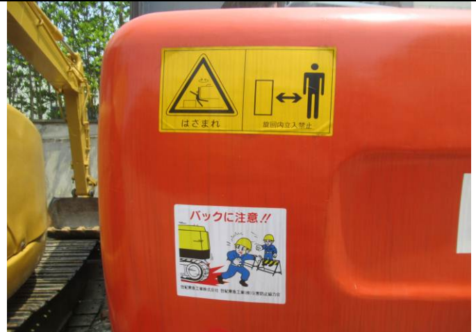
2 Excavator view