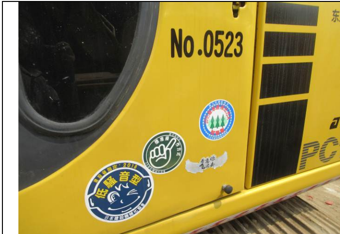
19 Excavator view