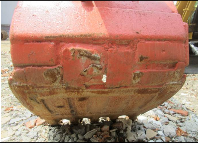
19 Excavator view