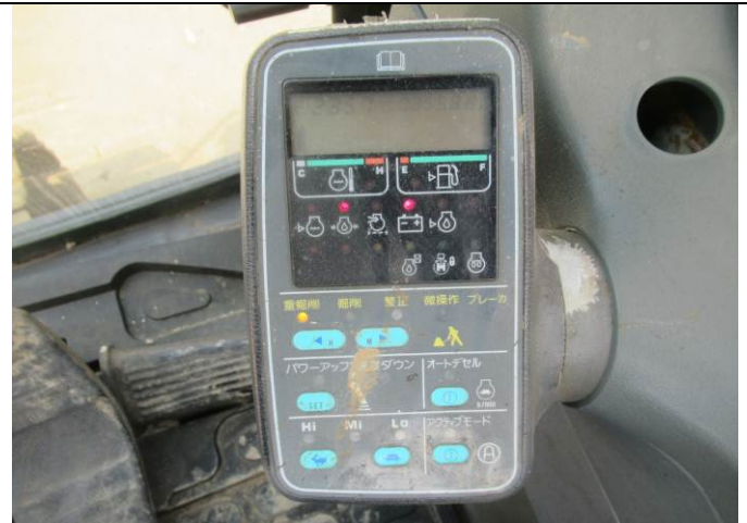
40 Excavator view