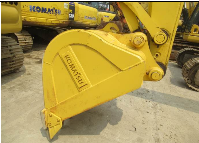
9 Excavator view