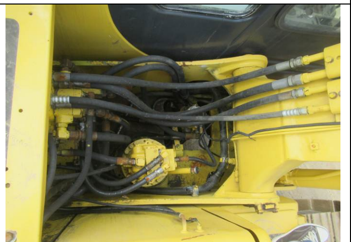
48 Excavator view