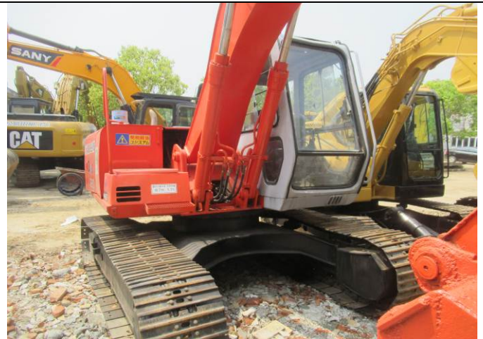
22 Excavator view