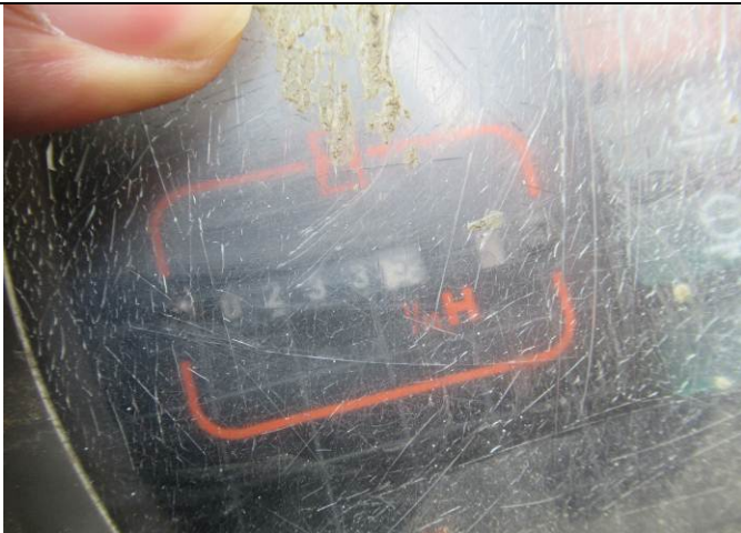
47 used hours