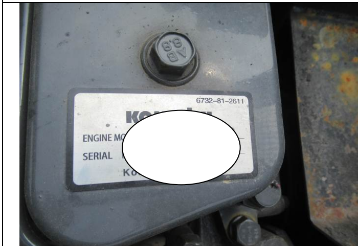
45 Engine rating label