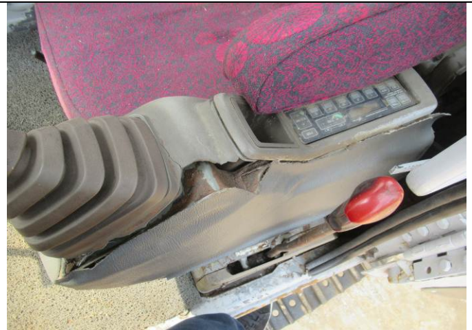
48 Excavator view