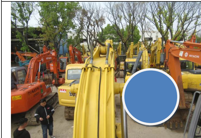
51 Excavator view